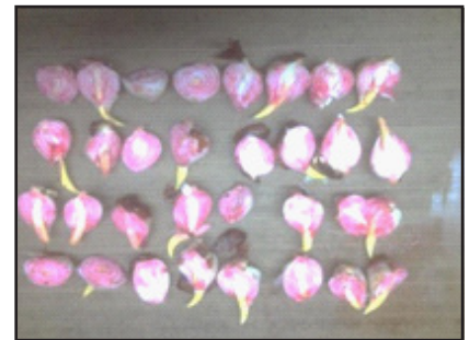
15 minutes after adding Purely Green, the dye penetrated 100%

NOTE: Nano particles serve as a broad spectrum bio-pesticide that has killed every gram negative insect observed treated.